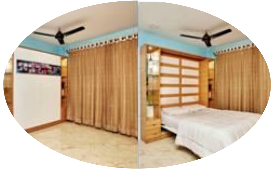
Space Saving Furniture